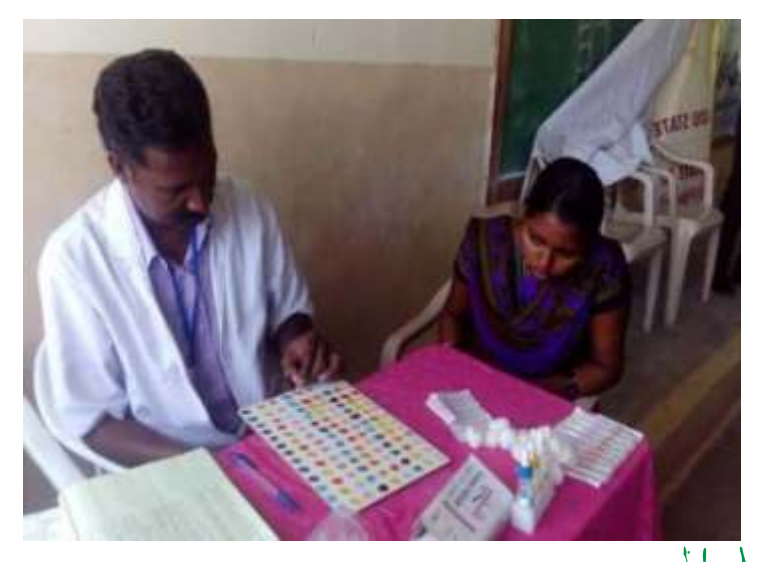
Coimbatore Institute of Management & Technology Narasipuram, Coimbatore - 641 109.

College Blood Donation Awareness is an important program that informs and motivates students about the value of volunteer blood donation. This awareness campaign, which is being run by student organizations or college administration in partnership with blood banks and medical experts, aims to debunk myths, increase public knowledge of the ongoing need for blood, and inspire students to donate to this life-saving cause. In the course of these efforts, seminars, educational sessions, and awareness campaigns are held in order to give students pertinent information regarding the procedure of donation. Colleges frequently host blood drives where staff, instructors, and students can freely donate blood. This program fosters a sense of civic duty and generosity among college students in addition to addressing the urgent demand for blood. Colleges can create a caring and health-conscious campus community by promoting a culture of blood donation awareness.