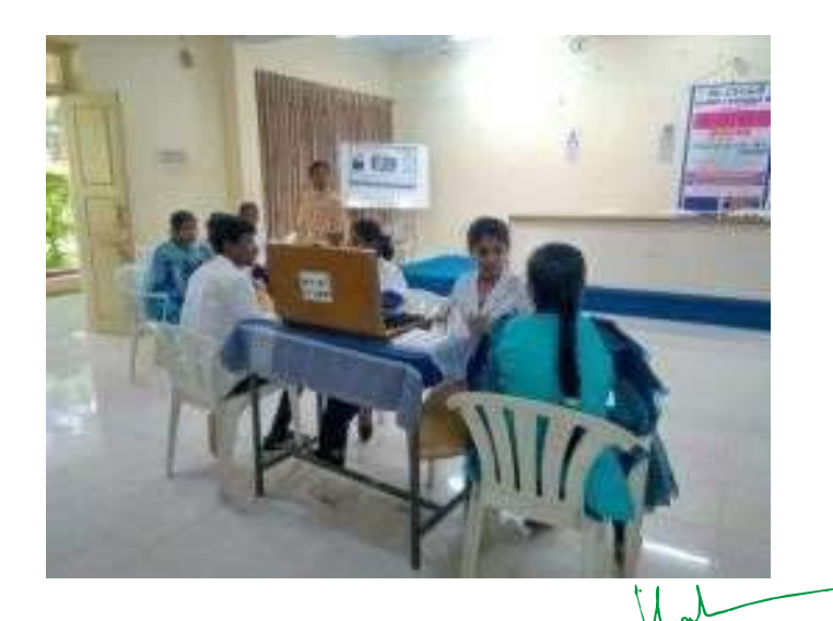
Principal Coimbatore Institute of Management & Technology Narasipuram, Coimbatore - 641 109.

A college eye camp is a health program designed to raise awareness of eye health issues among the student body. The camp, which is hosted by the institution in association with medical experts or organizations that provide eye care, gives students the chance to have thorough eye exams. Students usually receive vision tests at the camp, when common disorders including astigmatism, farsightedness, and nearsightedness are discovered. Apart from standard vision evaluations, the camp could also encompass examinations for intricate eye conditions or disorders. Additionally, advice on appropriate eye care procedures, the value of routine eye exams, and pointers for preserving eye health may be given to students.Camps for eye screenings can identify possible visual issues early on, allowing for prompt diagnosis and treatment. Additionally, they encourage preventative healthcare practices among college students. These camps place a high priority on kids' health as well as the importance of eye health as a vital component of general wellbeing.